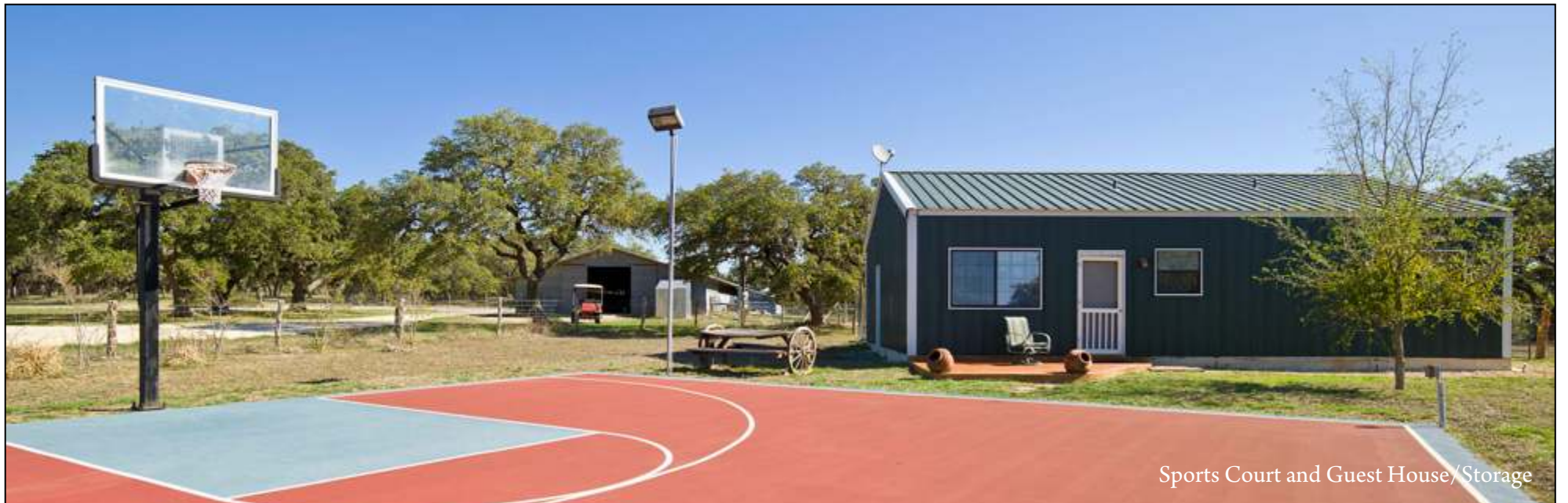
Sports Court and Guest House/Storage

A combination guest quarters/storage barn with adjoining sports court complete this family centric package. Bring your longhorns or your horses to this serene bit of heaven on earth, but in case you forgot some essentials, Boerne is only a short 8-mile drive away. Boerne ISD. Ag taxes.