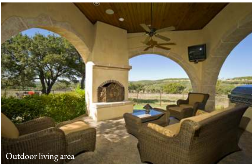
Outdoor living area

12 Acres, 3,490 +/- sqft (per Builder Plans) home with pool and outdoor living Plus a guest house/storage barn combo Offered at $849,000